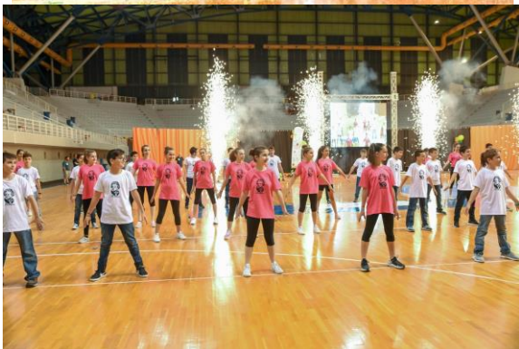
5 th and 6 th Graders